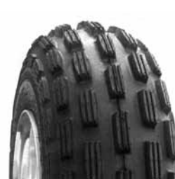
K284 Front Max