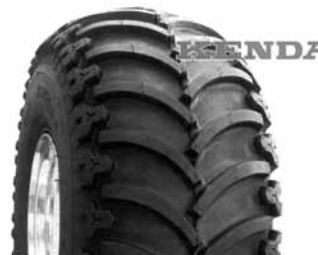
K277 Dirt Dog