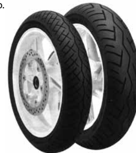
Battlax BT-45V Bias Ply