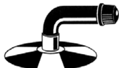
JS 87-Bent Valve