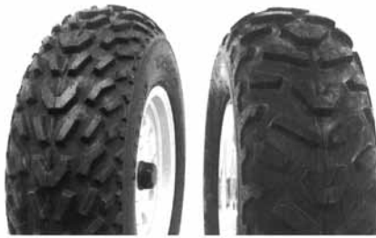
K530 Pathfinder-Front K530 Pathfinder-Rear